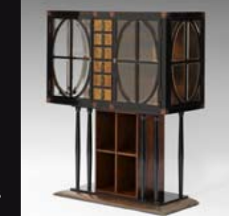
O. Prutscher attr., 1908